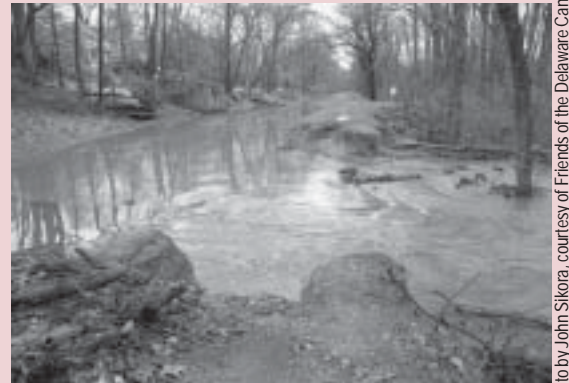
Repairs to the towpath near the David Library following September’s flood allowed the southern 25 miles of the Delaware Canal to be rewatered.