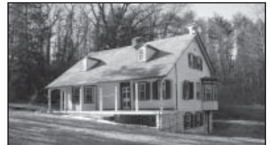
The Henry Homestead located at Jacobsburg State Park, Northampton County.

The Delaware & Lehigh National Heritage Corridor selects projects based on implementation of the Management Action Plan developed by the Commission. The D&L staff seeks applicants throughout the Corridor. Next year’s application process begins in Fall 2004.