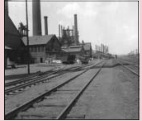
The silhouette of a once-booming steel industry dominates the skyline at the former Bethlehem Steel site, which was recently voted "one of America's 11 most endangered places" by the National Trust on Historic Preservation.

A cheer echoed up and down the Delaware & Lehigh Corridor on the day the former Bethlehem Steel site became "one of America's 11 most endangered places." Why cheer this not-so-complimentary label from the National Trust on Historic Preservation? Because, although the listing doesn't guarantee protection or funding of the site, it has been a powerful tool to save historic treasures in the past. The D&L submitted the application in hopes that the National Trust would recognize the fast-deteriorating blast furnaces and iron foundries that could preserve the history of an era. As the vision for Bethlehem Works evolves, this "endangered species" will draw the attention of local and national foundations and donors—who will help fund this industrial "museum" of sorts.